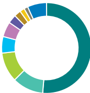
Geographic allocation (%)