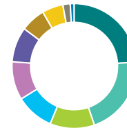
Sector allocation (%)