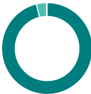
Geographic allocation (%)