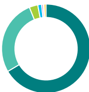
Geographic allocation (%)