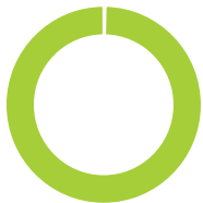
Asset allocation (%)