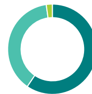
Sector allocation (%)