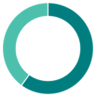
Asset allocation (%)